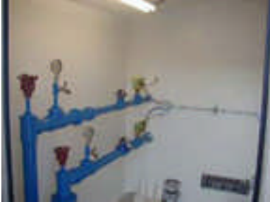
Pipes from supply well #1 and supply well #2 with in-line flow meters.