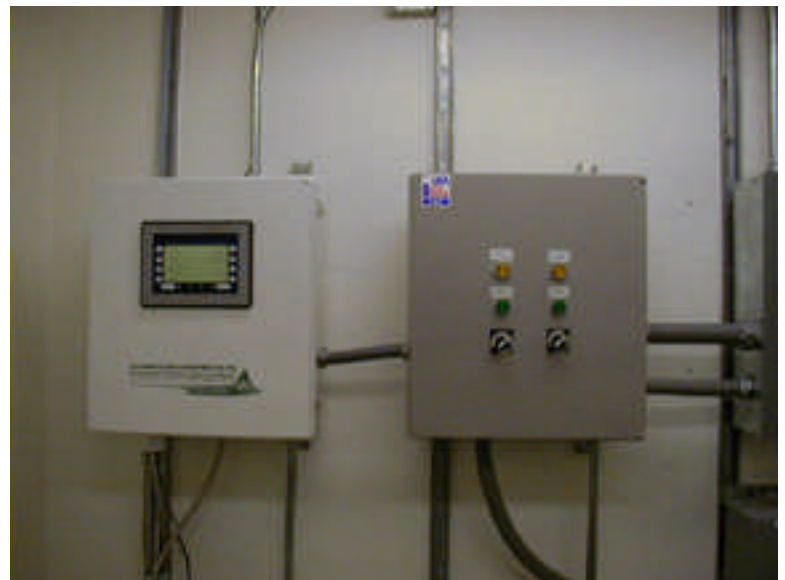
SCADA Measurement and Control Unit (right) with Display and Pump Panel (left)