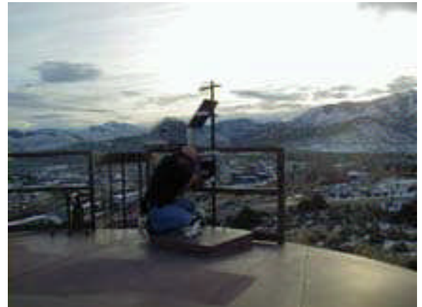
Remote Telemetry Unit installed on top of water storage tank

The Woodfords Indian Colony is located on the eastern side of the Sierra Nevada Mountains about 40 miles north of Carson City, Nevada. The Colonies water supply was being completely redone. Two new wells were drilled, a new pump and treatment house was constructed and a new water storage tank was erected. The Colony needed a system to monitor the water level in the two wells and in the storage tank. Based on the water level in the tank the system needed to turn on the pumps in each of the wells and monitor the flow from each well while it was on. The water quality of the second well had trace amounts of contaminants and therefore could not be used on a continuous basis. It could only run for 30 minutes a day and must run at the same time as the first well in order to dilute the contaminants enough so that they didn't cause any health threat. The Colony's operations center is actually located in Gardnerville, Nevada, which is about 20 minutes to the East and North of Woodfords, California. The operations people needed a way to have remote access to the system and wanted to have both local and a remote alarm capability. The alarms would tell them if the pumps had failed, if the water level in the storage tank was too low or high, and if the telemetry system had failed.