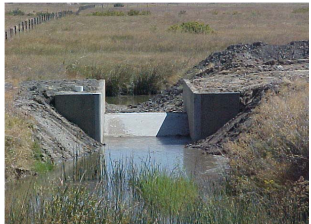
Figure 5. Constructed rectangular Replogle flume

The constructed flume is shown in Figure 5 .