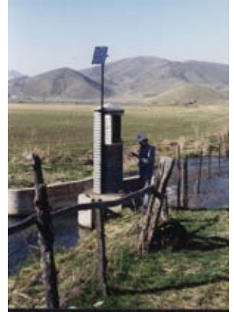
IEI personal performing annual calibration and maintenance

Intermountain Environmental, Inc. 601 W. 1700 S. Logan, UT 84321 Phone # 435-755-0774 www.inmtn.com