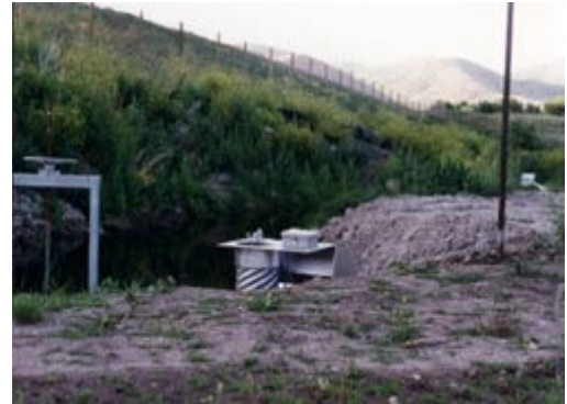
Mantua Wetlands, 2 ft. rectangular weir, custom stilling well, instrumented with a FP10C Float and Pulley attached to a CR10X Data logger.

Brigham City, Utah is located in the northern part of the state approximately 40 miles south of the Utah, Idaho border and 60 miles north of Salt Lake City. Water for irrigation uses comes from a watershed to the east of the city. The watershed includes several small streams and a small reservoir. (Mantua Reservoir) In order to monitor and maintain its water rights, Brigham City found it needed some way to track the amount of water that was flowing from these tributaries into and out of its canal systems.