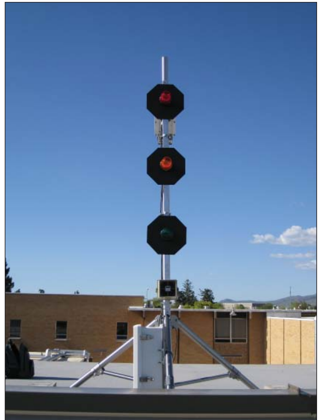
Logan High School in Logan Utah has installed a lightning warning system that includes the CS110. The CS110 is mounted to a CM110 10-ft stainless-steel tripod that sits on a roof next to the football field (left). Lights included in the system indicate the likelihood of lightning (right).